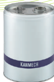
20Ltr GI DRUM