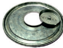
4" LID OPENING