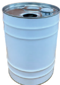
Integrated Spout Drum