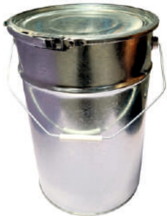
GI OPEN TOP